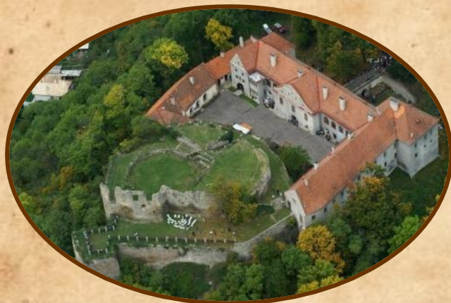
Zvolen (70 km)