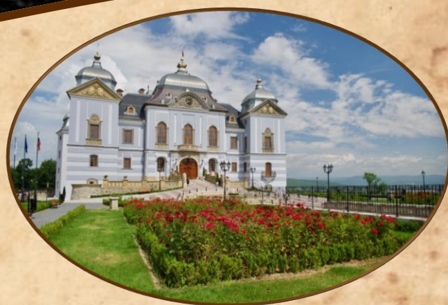
Zichy Castle and Historical Museum in Divín (35 km)